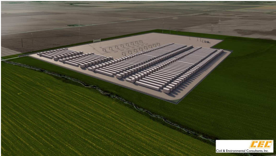
Birds-eye view from County Rd 150 E